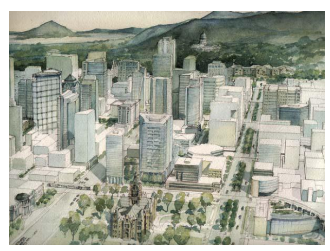
Artist: Paul Brown

Little America Hotel is located downtown, at 500 South Main Street, in Salt Lake City. The annual